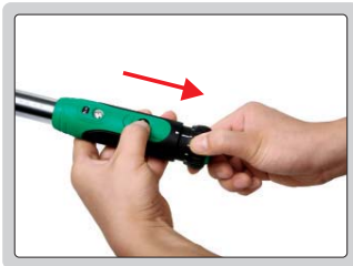
step 1: unlock