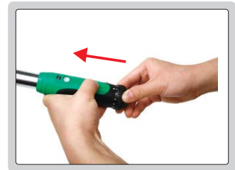
step 3: lock