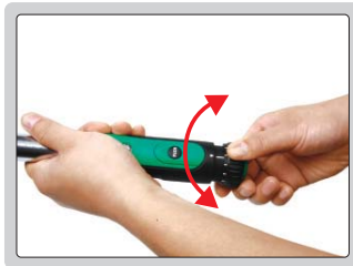
step 2: adjust